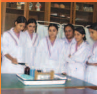
Community midwives being trained by the Pakistan National Maternal, Neonatal and Child Health (MNCH) program in Sindh.