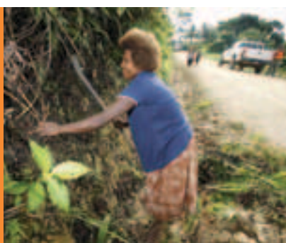
Local villagers clearing vegetation from beside the roads as part of a Community Sector Program in Solomon Islands