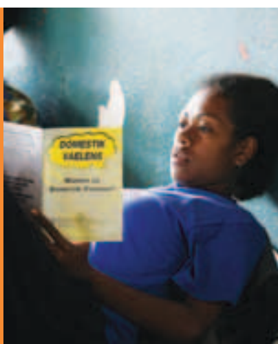
In the Port Vila vegetable markets, a young girl reads a booklet on domestic violence and her rights.