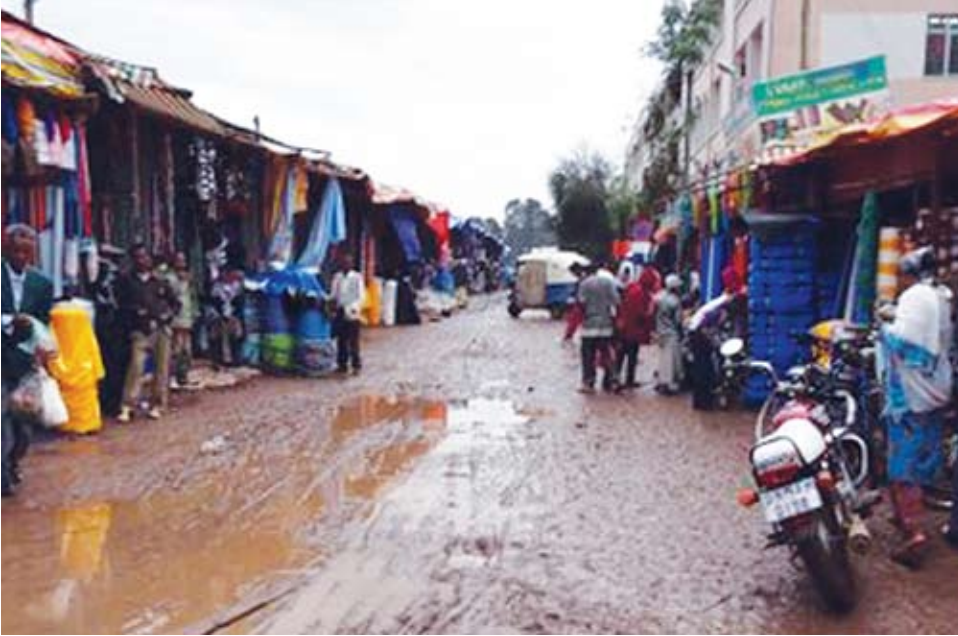
A BUSY MARKET STREET IN URBAN ETHIOPIA.

Down a dusty suburban street, behind high white washed walls, gates and razor wire sits a small brick house, just like countless others in the Ethiopian city of Adama. What's special about this particular address is that it contains a service funded entirely by UN Women that is creating a future for women and girls who have experienced unthinkable abuse.