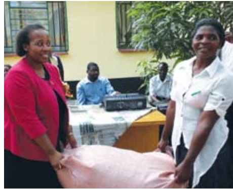
UN WOMEN’S SENIOR ADVISER FOR WOMEN’S ECONOMIC EMPOWERMENT RECEIVING THE 30KG BAG OF KAPENTA FROM ONE OF THE FISHING RIG MEMBERS DURING THE CEREMONY FOR THE LAUNCH OF THE WOMEN’S BANK.

In Binga, where 58 per cent of the households are female-headed, the bank is providing women with the means to take care of their families and make choices that will help them to become economically empowered. At the launch of the Women’s Bank in Binga in October 2012, women told how they struggled to find financing to start small business-