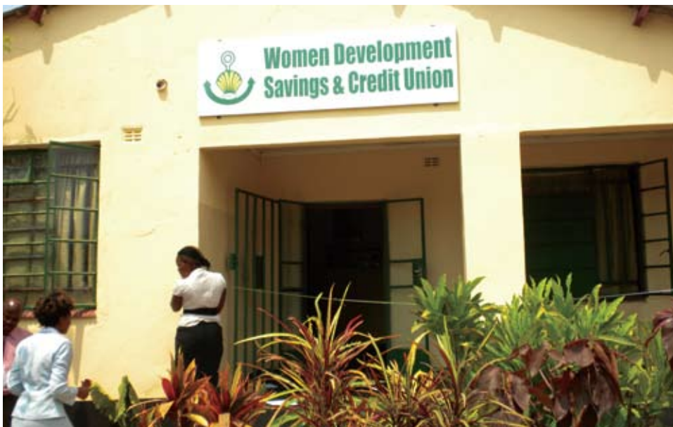
THE NEW BANK JUST BEFORE THE RIBBON WAS CUT ON OCT 11, 2012.