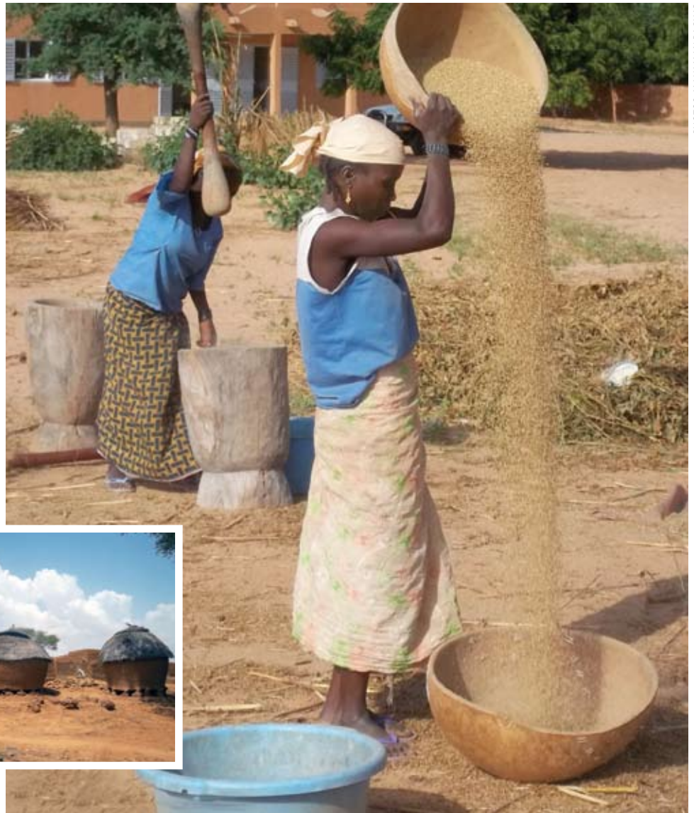
WOMEN MAKING GRAIN FOR THEIR PORRIDGE. (LEFT)THE GRANARIES OF THE VILLAGE.

Great strides have recently been made toward gender equality in leadership as the number of elected women has increased, especially as deputy mayors. In 2002 a quota law was adopted by the Government obliging all competing political parties to allot 10 percent of their elected positions to women.