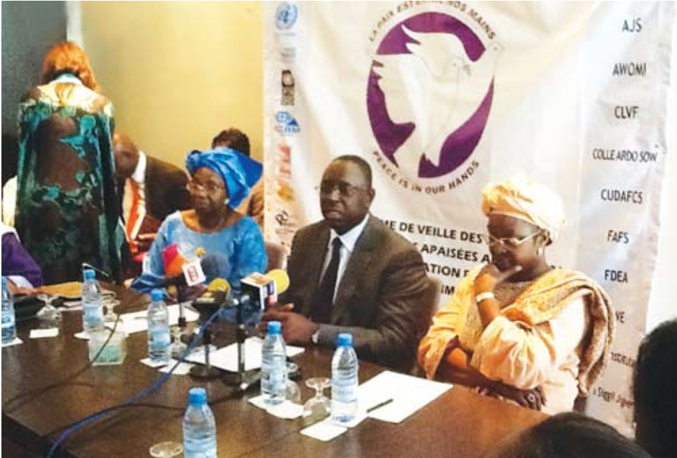
PRESIDENT MACKY SALL IN THE WOMEN'S SITUATION ROOM.

Senegal has made great strides in equal participation for women in politics. Now nearly 45 percent of the seats in parliament are occupied by women. There are a total of 150 seats and 64 are held by women. These impressive results are a result of a conducive legal framework coupled with multiple strategies for engaging women in elections.