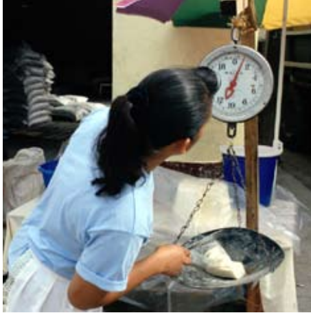
Foto: A street vendor weighs goods in the open-air market in Marcala, Honduras.

Microenterprises are one of most important economic alternatives available to poor urban women living in areas titled by the public sector entity in charge of providing housing property titles in Peru. 90 Demand for business training and capacity building is high among women microentrepreneurs in the target population. Although almost all are literate, few had access to business training and so must rely instead on personal experience. 91 Some creditors have begun training women in the use of credit. For example, Mibanco 92 has offered free business training