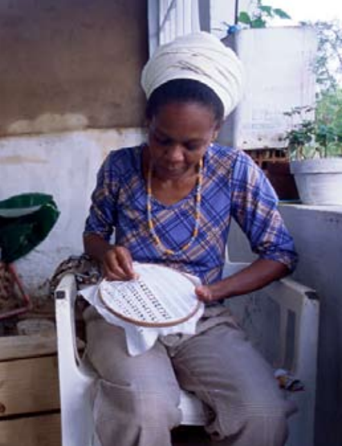
Foto 1: A young woman learns to how to crochet in a workshop in Salvador, Brazil.