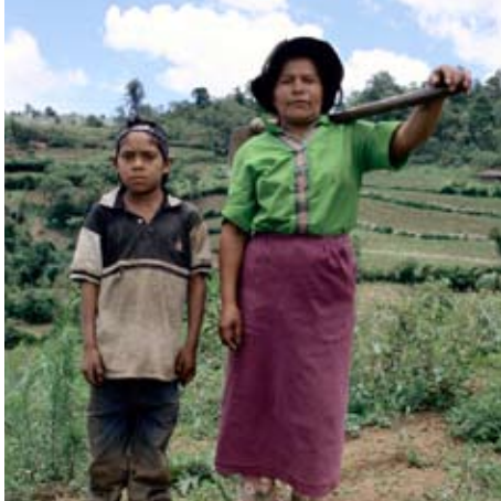
Foto: A farming family poses during a break in planting corn Yarula, some 180 kilometers from Tegucigalpa.

Consider women's needs in terms of the schedule and location of information meetings and trainings, the hours and location of registration offices, and documentation requirements (e.g. women may not have identification papers).